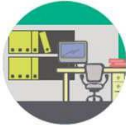
Offices, Bars & Restaurants