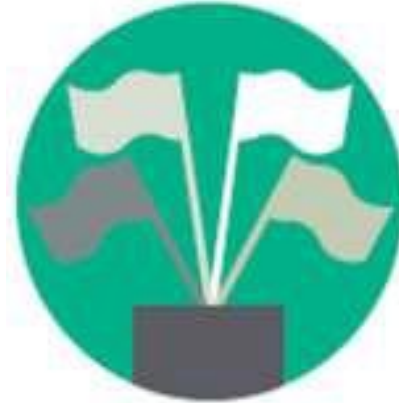
Exhibition Stands & Pop Up Shops