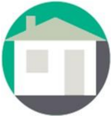
Homes, Hotels & Resorts