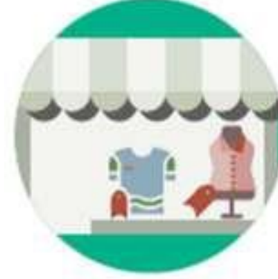
Retail Stores & Commercial Fitouts

Any project requiring a quick, clean and cost effective fit out with the highest quality porcelain – be it a new build or renovation.