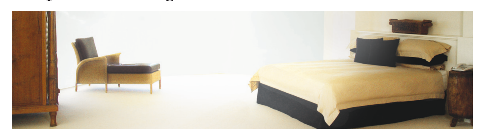
...deserves the best solution.