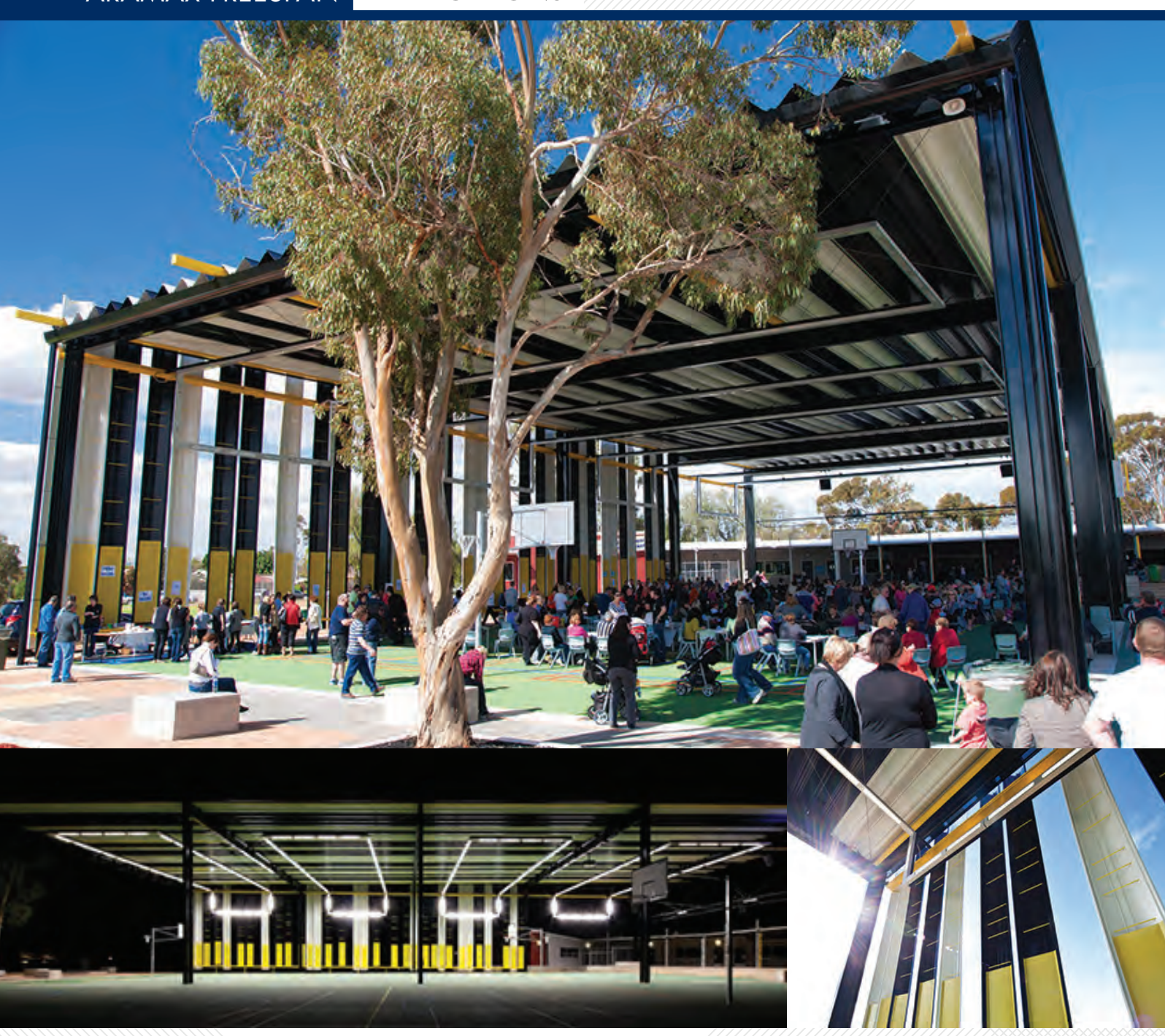
CARITAS COLLEGE | LOCATION Port Augusta, SA | ARCHITECT Tridente Architects

The result was an under utilised outdoor area transformed into a multipurpose hub, used both at day and night for many years to come, thanks to the durability of ARAMAX FreeSpan.