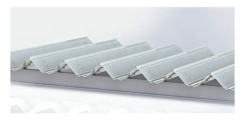
Figure 2: Typical connection showing use of connection plates.

Further information visit www.aramax.com.au