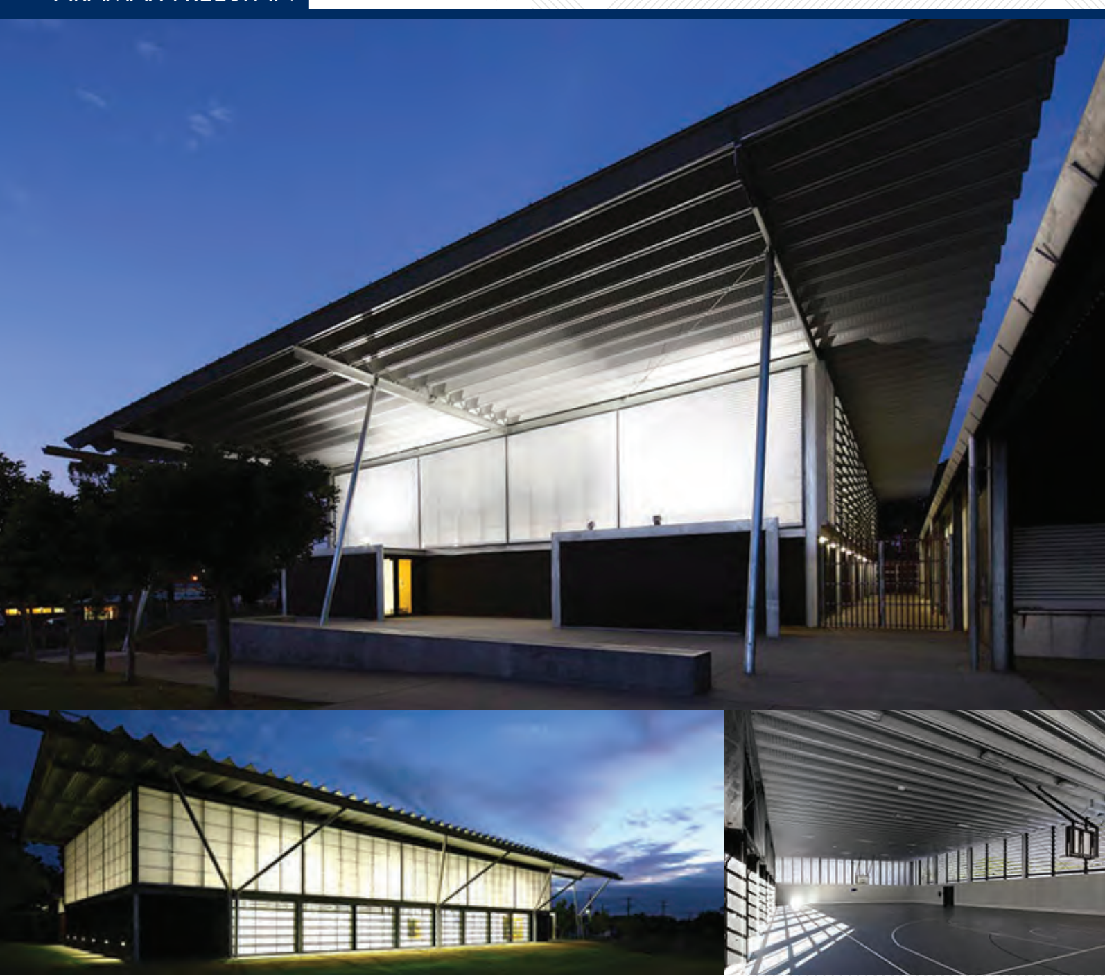
AIICS MULTI-PURPOSE HALL | LOCATION Brisbane, QLD | ARCHITECT Richard Kirk Architect

ARAMAX FreeSpan was selected for its unsurpassed spanning capacity enabling the roof sheeting to span unsupported between steel portals, eliminating the need for roof purlins. Perforated ARAMAX FreeSpan sheeting is also used internally on the ceiling to provide consistent finish and acoustic attenuation.