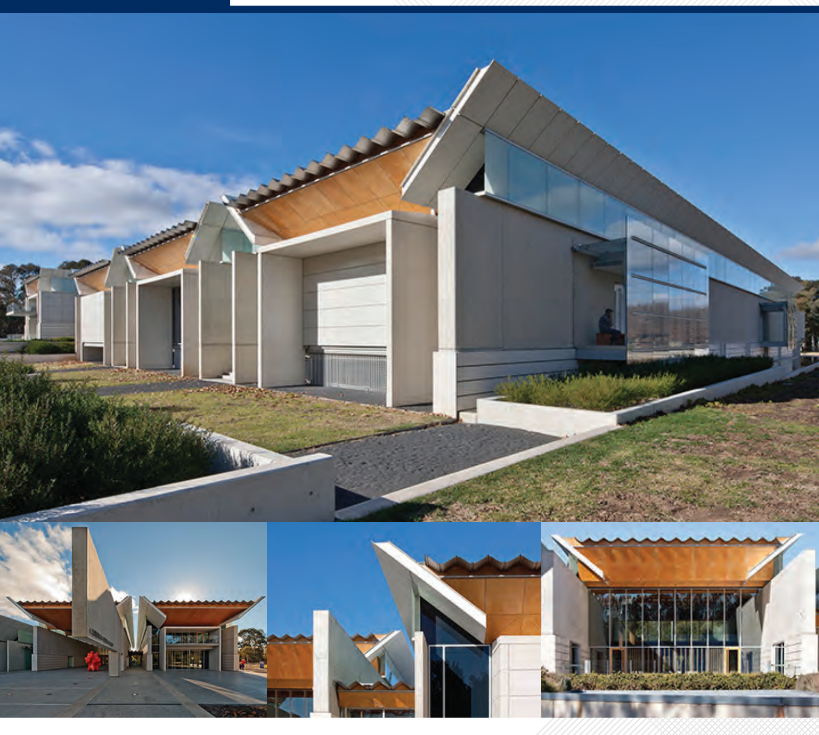
NATIONAL PORTRAIT GALLERY | LOCATION Canberra, ACT | ARCHITECT Johnson Pilton Walker

ARAMAX FreeSpan contributes to the elegant planning and formal expression of this building.