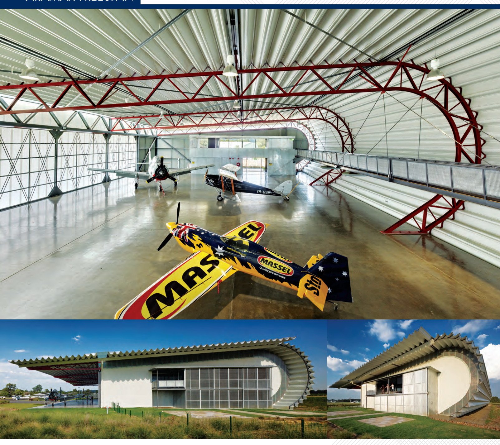
THE HANGAR | LOCATION Cessnock, NSW | ARCHITECT Peter Stutchbury Architecture

The Hangar is a gallery, public museum and operation facility for a collection of World War II aircraft. The incorporation of ARAMAX FreeSpan as the cantilevered roofing and walling profile allows the design to be technically sophisticated yet a romantic enclosure with sufficient volume to provide for the movement of aircraft.