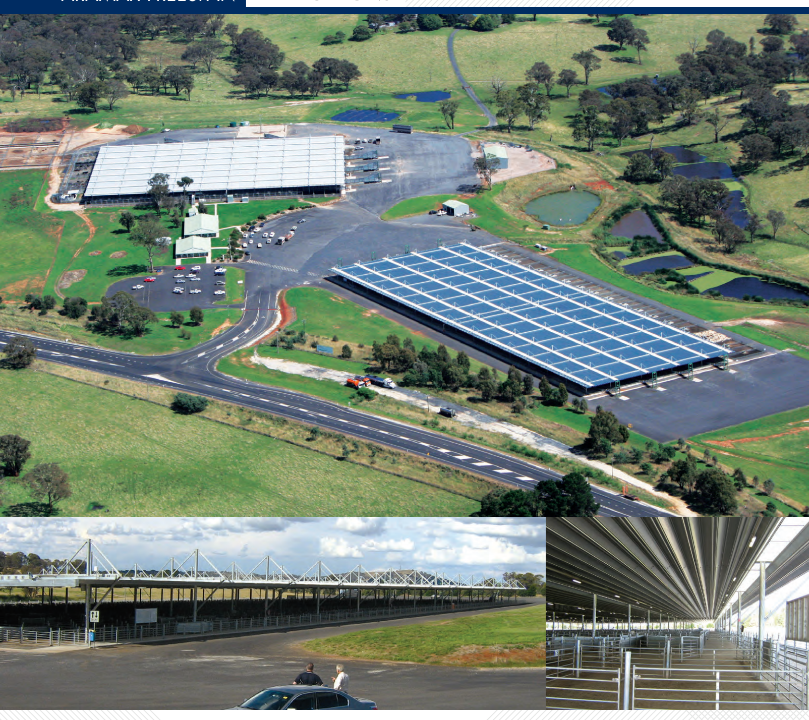
THE STOCKYARD | LOCATION Carcoar, NSW

The Australian livestock industry has changed a little over the decades. The Stockyard has moved towards the integration of design and functionality. With its large spanning capability, ARAMAX FreeSpan played an important part in meeting the design specification on such a large project. The stockyard holds the record for Australia's longest continuous roof sheets. At a length of 144 metres, the roof sheeting was rolled onsite, providing both cost and time saving benefits.