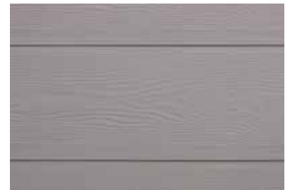
Windspray / Acrylic water based paint