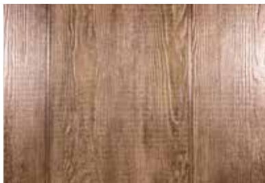
Spotted Gum / Exterior Stain oil based

Stratum™ is a vibrant and innovative alternative to traditional weatherboards and now with a timber texture you have the best of both worlds – the longevity of Fibre Cement and the character of timber. The deep shadow line creates a contemporary aesthetic with two groove options to choose from.