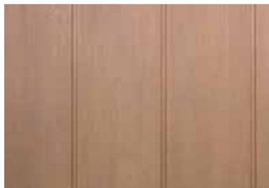
Cedar / Exterior Stain oil based