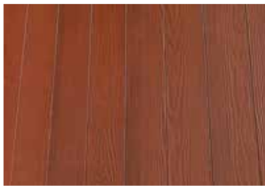
Merbu / Exterior Stain oil based

Duragroove™ Wide and Extra Wide Profiles add flexibility to the design of any facade. The shiplap joint makes it easier and faster to install and our offer of 3 sheet sizes helps reduce costly wastage.