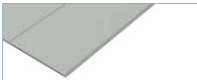
A vertically grooved panel with 150mm between the grooves