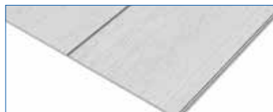
A vertically grooved panel with 400mm between the grooves