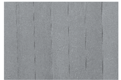
Woodland Grey / Acrylic water based paint