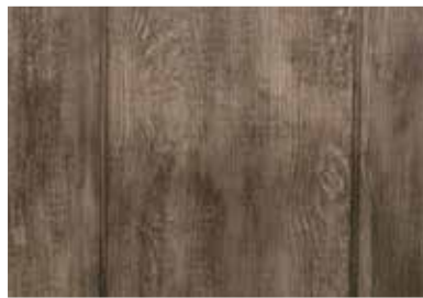
Charcoal / Exterior Stain oil based