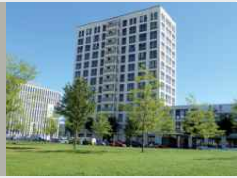
Panorama Tower – economic and efficient vibration and sound insulation