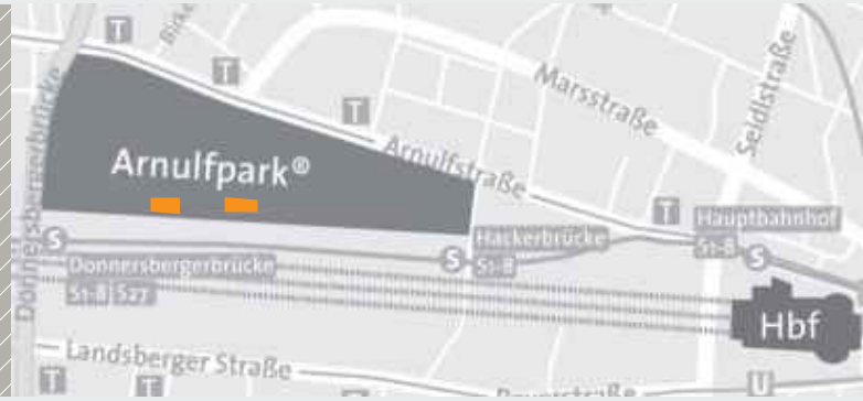
Site plan: Arnulfpark with Panorama Towers