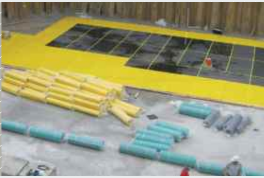
Professional building protection using Sylomer® and Sylodyn®