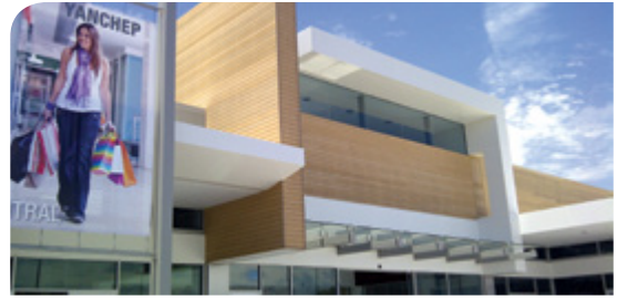
Duro Clad Composite

Whether you choose real timber, or our natural looking composites, you'll experience easy installation, stylish design and a product that's been built to withstand even the harshest environment.