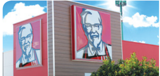
Euro Clad Composite