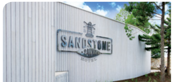
Newport Hector Cladding