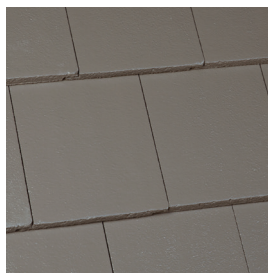
To view colour swatches for each state refer to www.monier.com.au

A sleek, flat profile is finished with a clean nose delivering streamlined roof lines in a palette of earthy, natural tones.