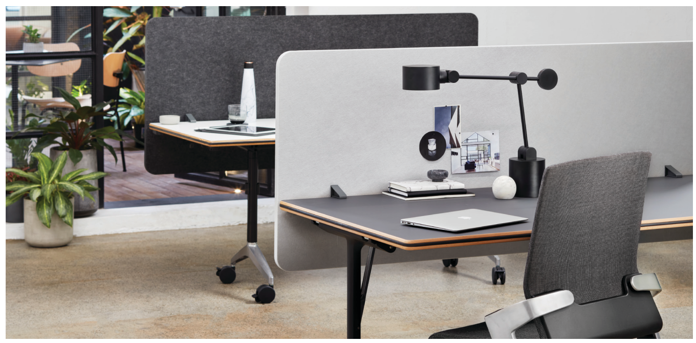
IMAGE FEATURES ADAPT CLASSIC IN COLOURWAY #542 AND #101 WITH DESK CLAMPS IN #542

IMAGE SHOWS DESK CLAMPS ATTACHED TO ADAPT SCREEN