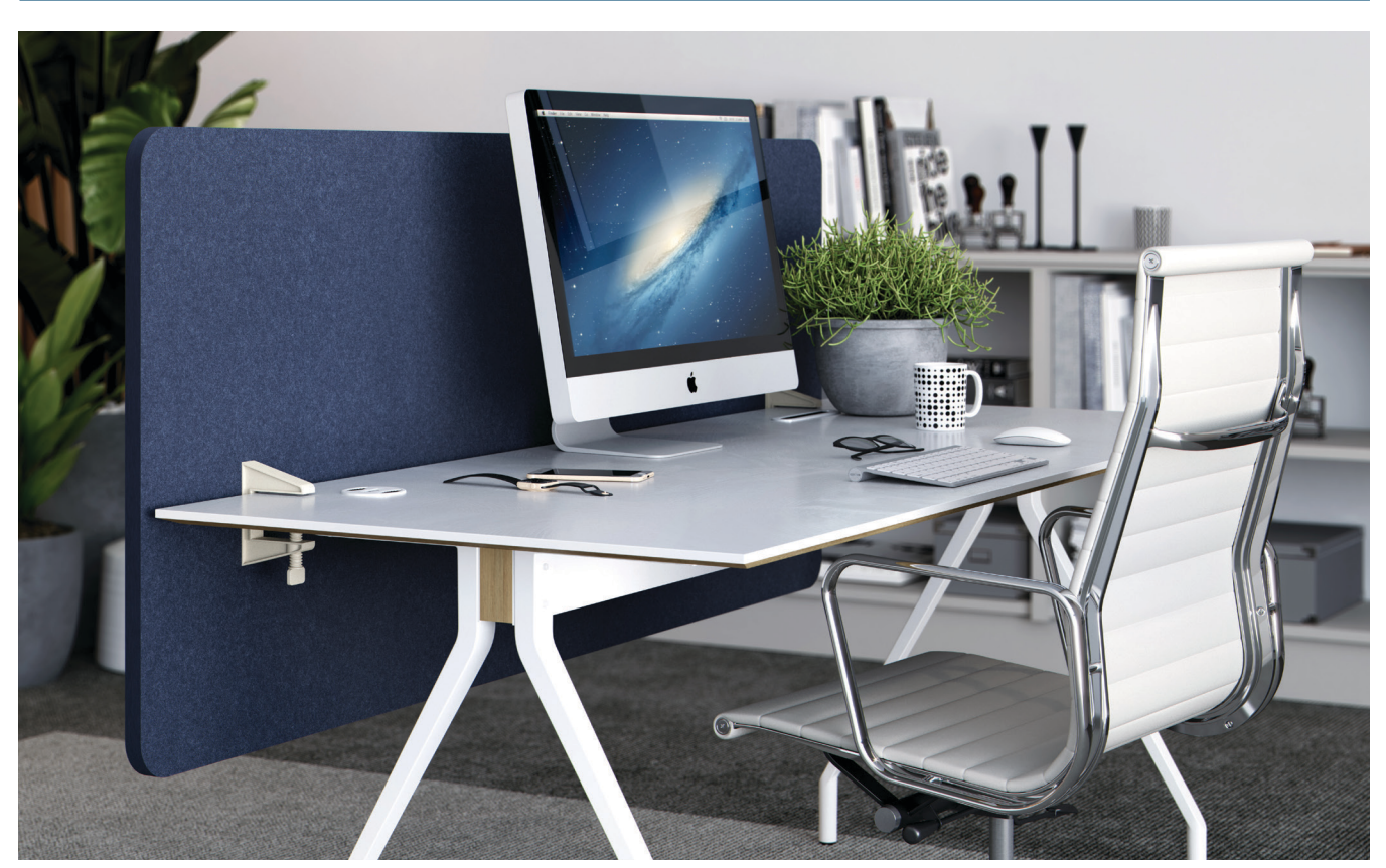
IMAGE FEATURES ADAPT CLASSIC IN COLOURWAY #365 WITH DESK CLAMPS IN #908