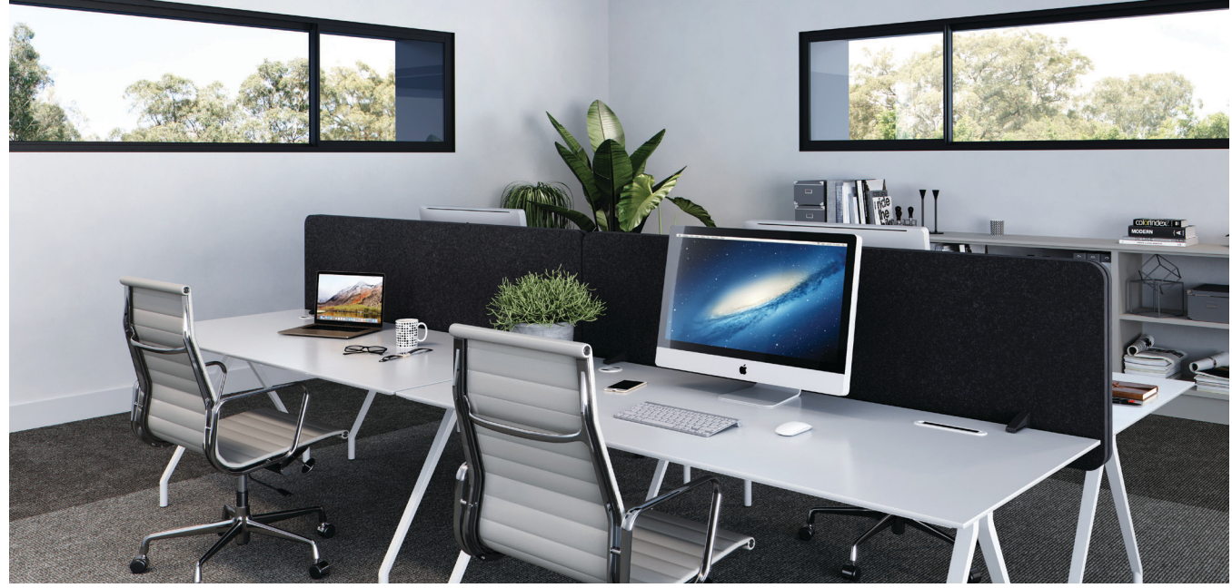
IMAGE FEATURES ADAPT SOCIAL IN COLOURWAY #542 WITH DESK CLAMPS IN #542