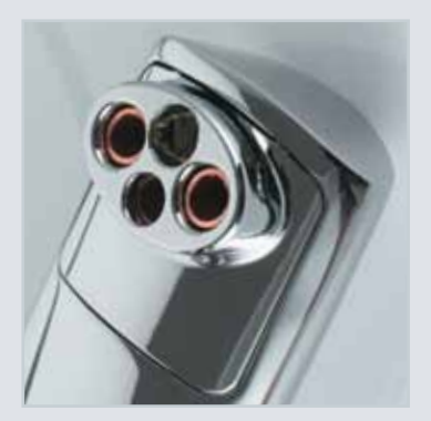
DRIP-FREE DESIGN FOR CLEANER WORK AREAS