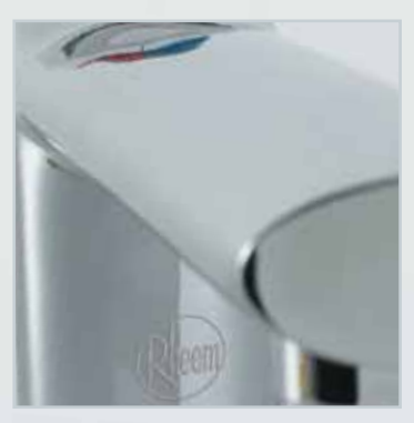
QUALITY CHROME PLATED CAST METAL BODY FOR STYLE AND DURABILITY