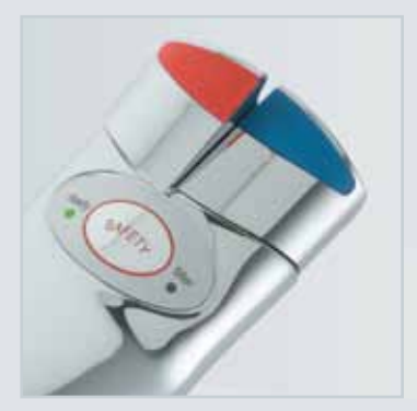
RUBBER TIPPED ACTIVATION LEVERS FEATURE MOMENTARY AND LOCK-ON POSITIONS TO ASSIST WITH FILLING INDIVIDUAL CUPS OR LARGE JUGS