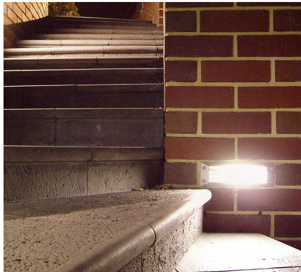
LED9681 240v x 24 LED