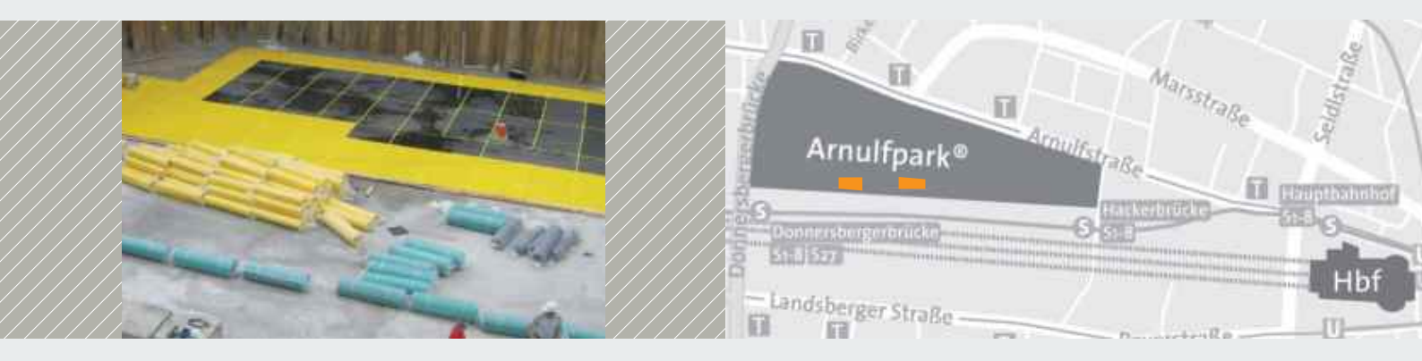
Professional building protection using Sylomer® and Sylodyn®