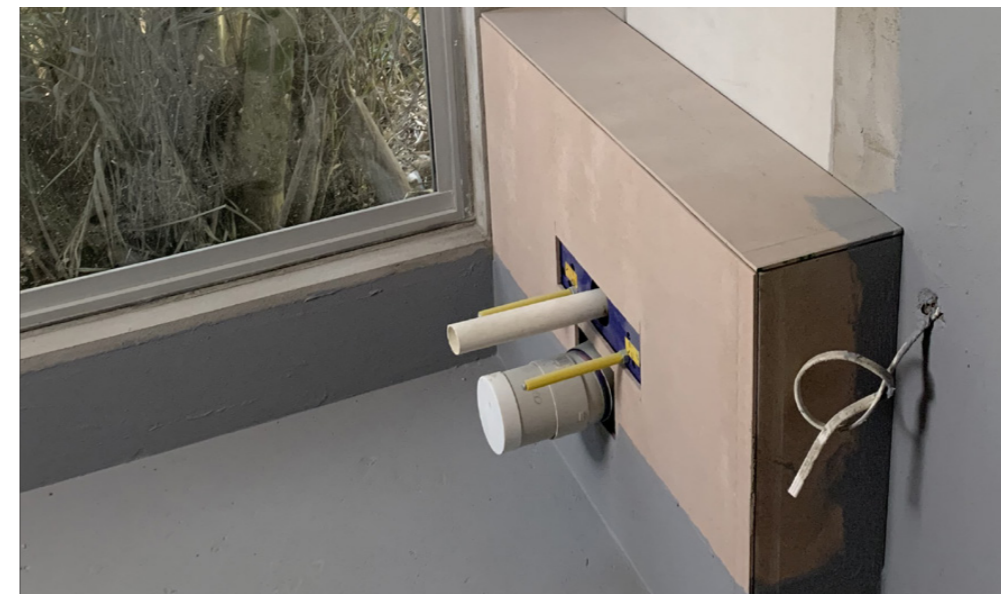
← New Geberit Sigma8 Concealed Cistern installed.