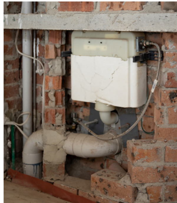
↑ Over 20 years of service, the original cistern functions without issue.