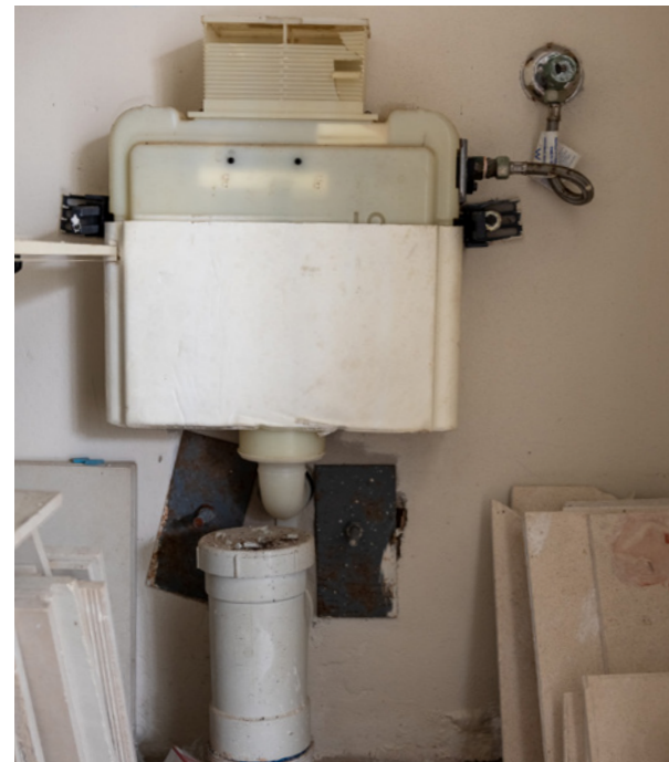
↑ Original Geberit Concealed Cistern stands the test of time.

When asked whether there was any resistance from the trades team surrounding the concealed cisterns, Phil's reply is emphatic: "No, not at all. The plumber actually pointed out how easy it is to install because of the frame, for example, and the accessibility. It's sensational," he says.