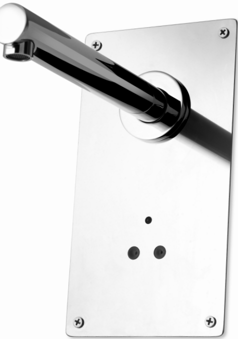
Order Code: 100-0189