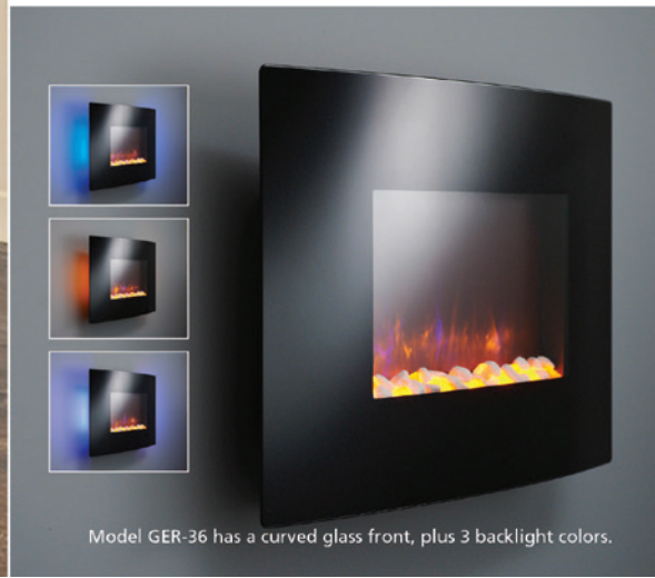
Model GER-36 has a curved glass front, plus 3 backlight colors.

This hot fireplace feels cool to the touch, yet puts out heat when you want it. It hangs like a piece of art – easy to install and set up. Place it on any interior wall with an electric outlet. Just plug it in and have a beautiful fire. All linear models are flat, except the GER-36, which has a curved glass front.