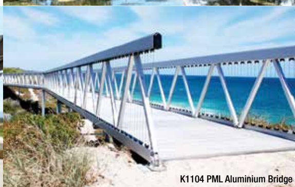
K1104 PML Aluminium Bridge