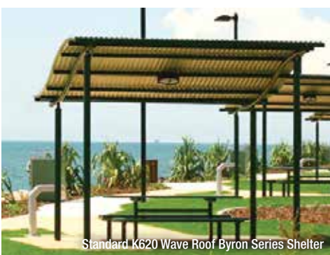
Standard K620 Wave Roof Byron Series Shelter