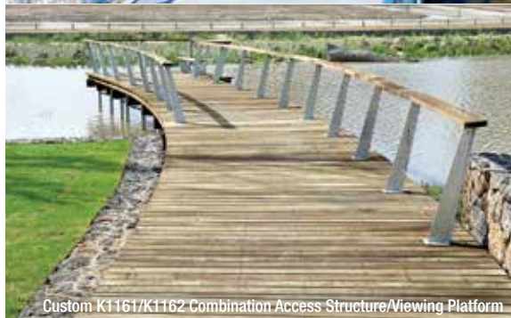
Custom K1161/K1162 Combination Access Structure/Viewing Platform