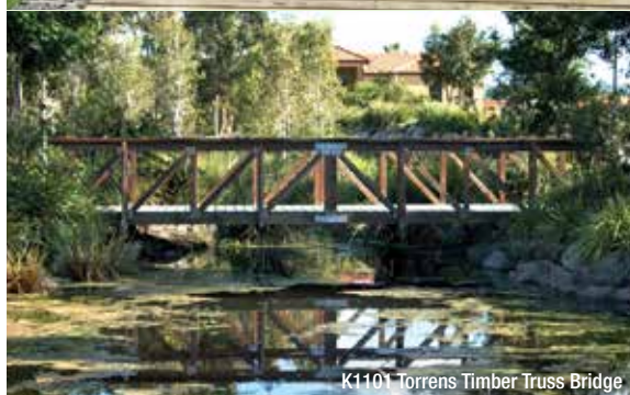
K1101 Torrens Timber Truss Bridge