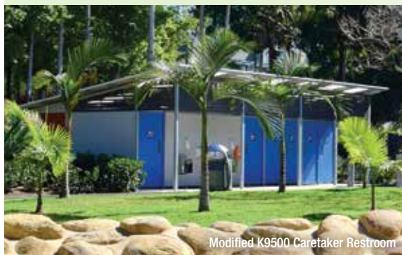
Modified K9500 Caretaker Restroom