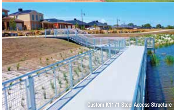
Custom K1171 Steel Access Structure