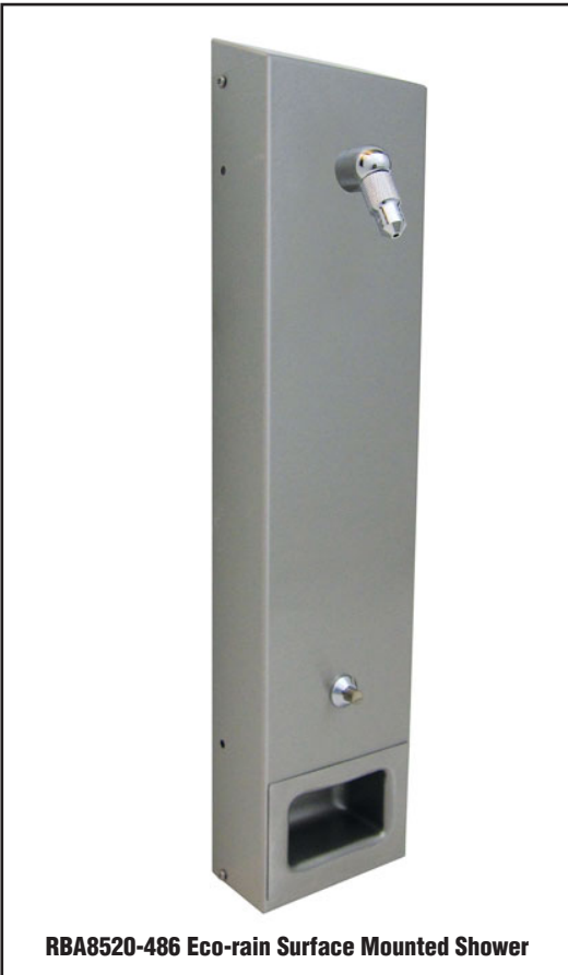
RBA8520-486 Eco-rain Surface Mounted Shower