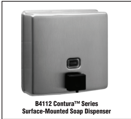
B4112 Contura™ Series Surface-Mounted Soap Dispenser