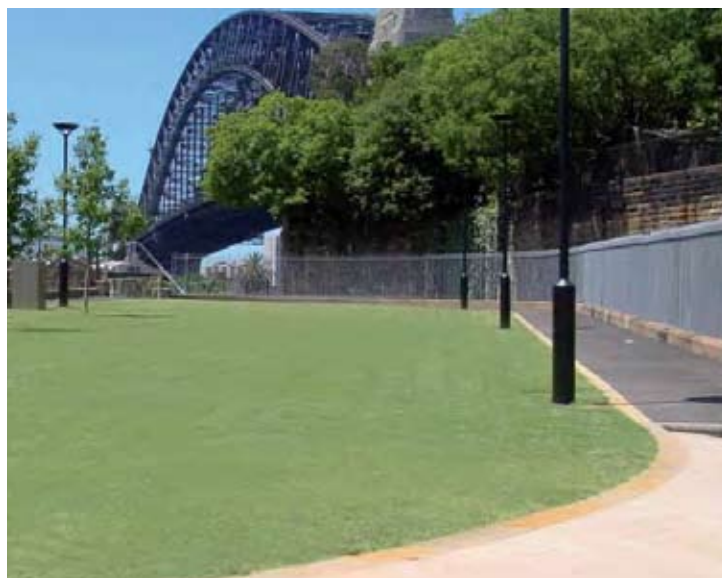
TurfPave provides efficient turf stabilization on overflow car parking and pedestrian walkway areas