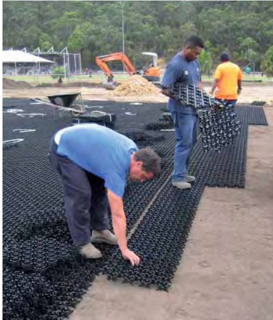
TurfPave modules securely interlock, conform to uneven surfaces and are easy to install