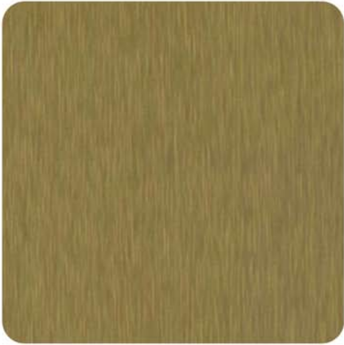
GOLDEN BARK |