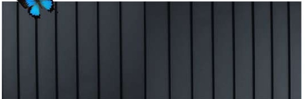
CHARCOAL BLACK |