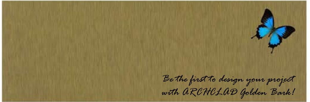
GOLDEN BARK |