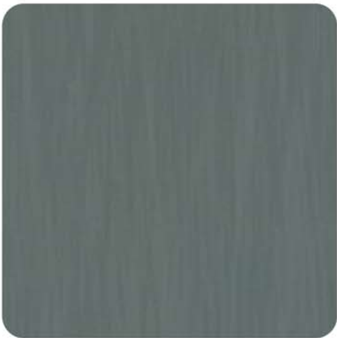
STONE GREY |