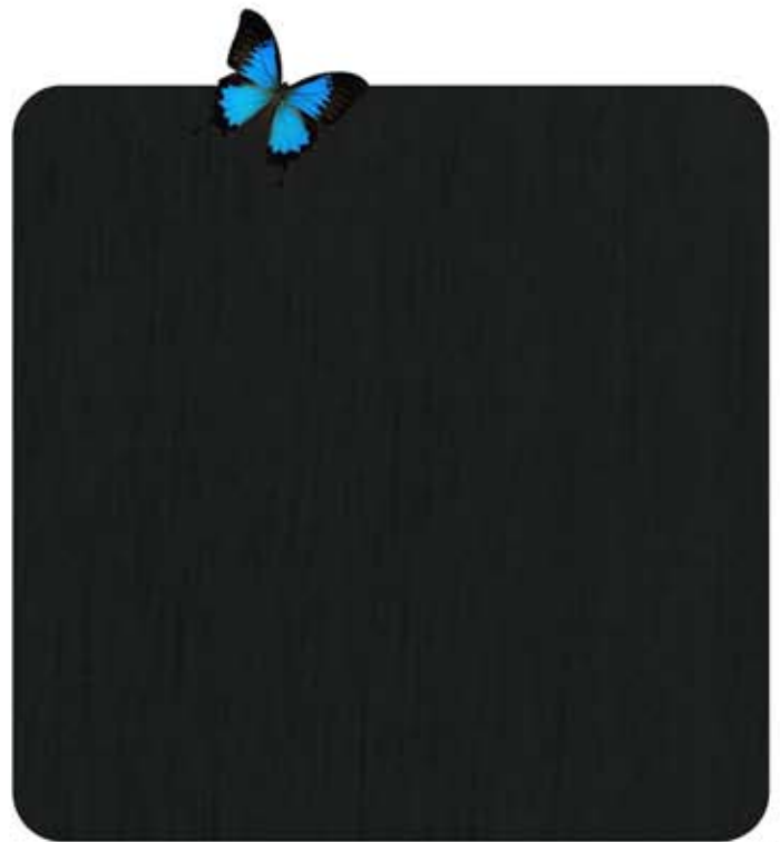
CHARCOAL BLACK |