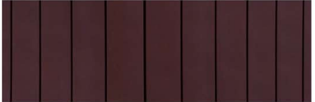
ANTIQUÉ COPPER |