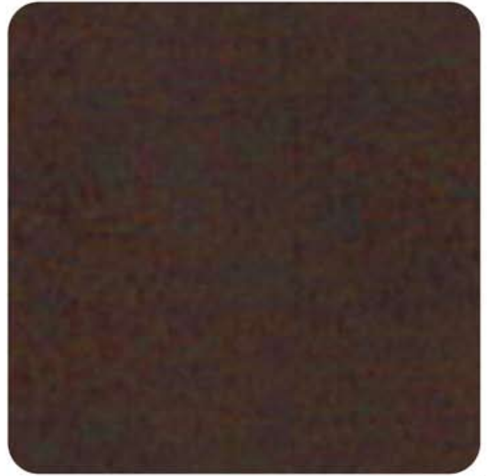
ANTIQUE COPPER |