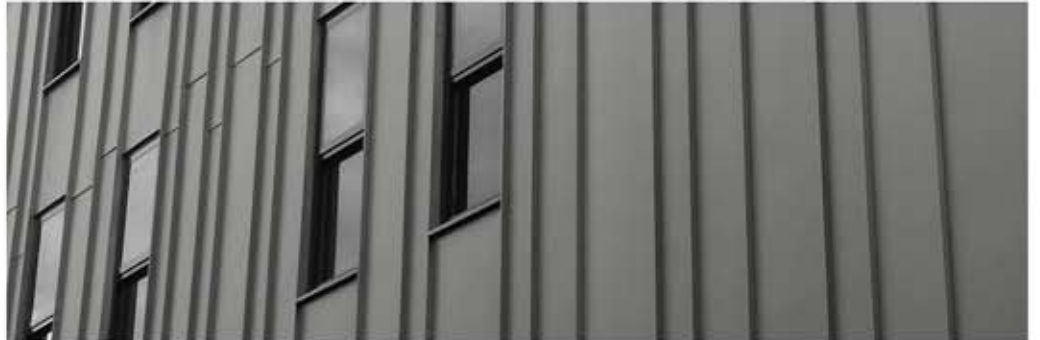
STONE GREY |