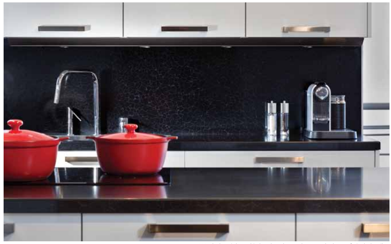
1620 Black Knight™, kitchen benchtop.

Supremo™ quartz surfaces are not only beautiful to look at and unique in design, but also superior in durability. Non porous, safe and hygienic, they are also easy to care for – there's no need to seal, polish or wax - all that's needed is a mild cleaning detergent and surfaces will maintain their long lasting luster.