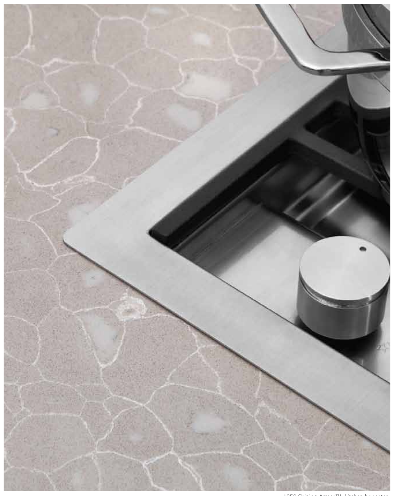
1050 Shining Armor™, kitchen benchtop