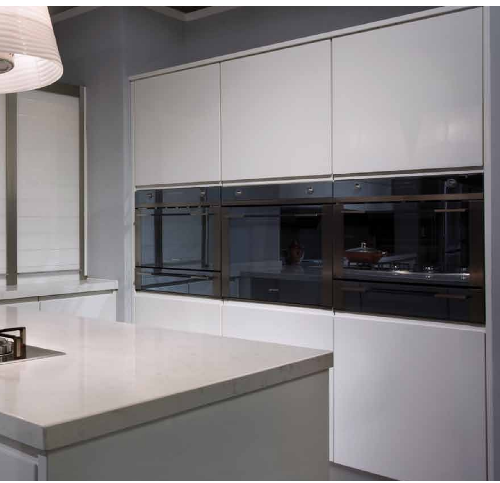
1600 Swan Lake ^{\text{TM}} , kitchen benchtop.