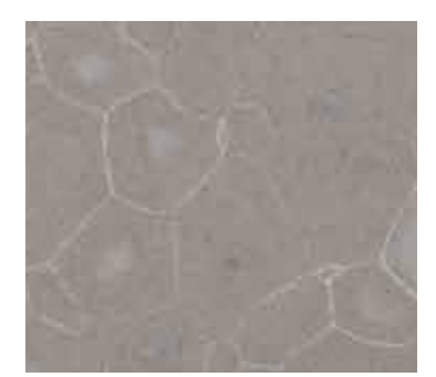
1050 Shining Armor™