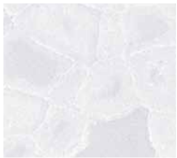
1600 Swan Lake™