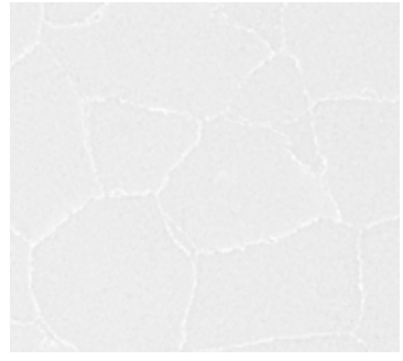
1650 Fair Lady™

Supremo™ comes in six elegant and stylish colours. From light and delicate to dark and contemporary – there's bound to be a shade to suit you. With Supremo™, you can put your unique stamp on any room, and create an interior finish which is strikingly different from any other - a look which is truly your own. The Supremo™ collection is suitable for all applications - from kitchen benchtops and splashbacks to wall paneling, vanity tops and even custom-made furniture.