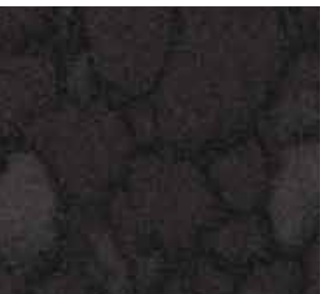
1150 Queen of Sheba™