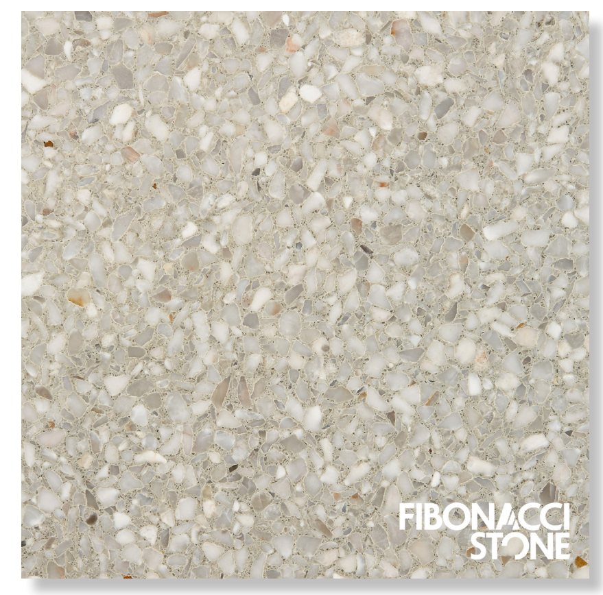
ABOVE : Pewter Terrazzo Tile sample at 100mm x 100mm BELOW LEFT: Pewter Honed single tile at 400 x 400mm BELOW RIGHT: Arrangement of 4 Pewter Honed tiles at 400 x 400mm each