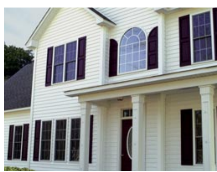
MANUFACTURED TO AUSTRALIAN STANDARDS AS/NZS 4256.1