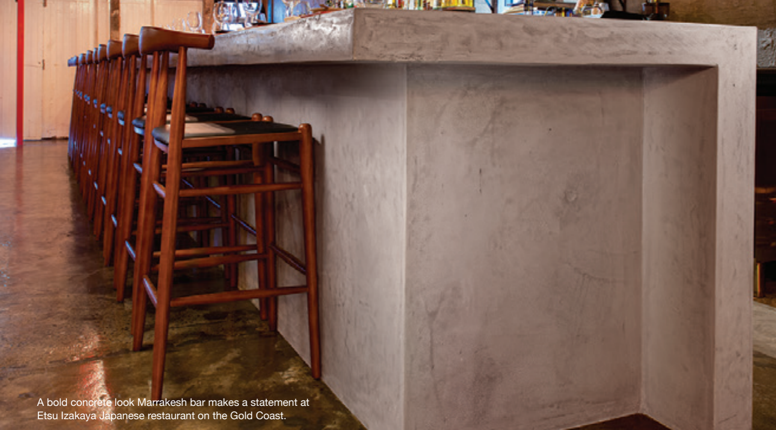
A bold concrete look Marrakesh bar makes a statement at Etsu Izakaya Japanese restaurant on the Gold Coast.

"Earth render is inviting and warm, it has been used for hundreds of years but can work well in a modern environment."