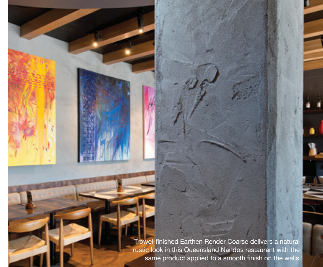
Trowel-finished Earthen Render Coarse delivers a natural rustic look in this Queensland Nandos restaurant with the same product applied to a smooth finish on the walls.