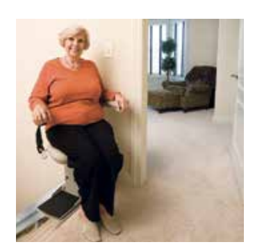
Power swivel seat for effortless exit. Controlled on chair arm or wireless call/send.