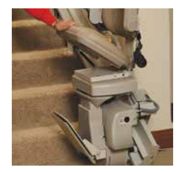
Power folding footrest automatically flips up/ down when seat is raised/ lowered.