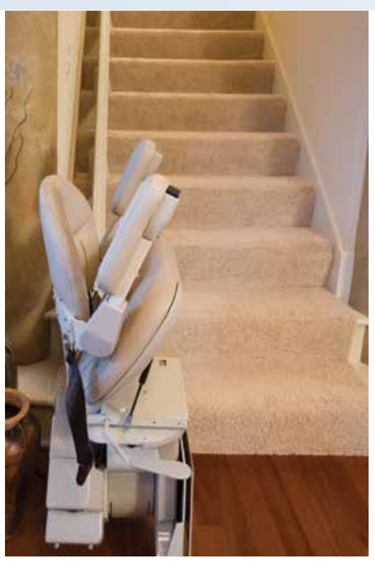
Close installation to wall.