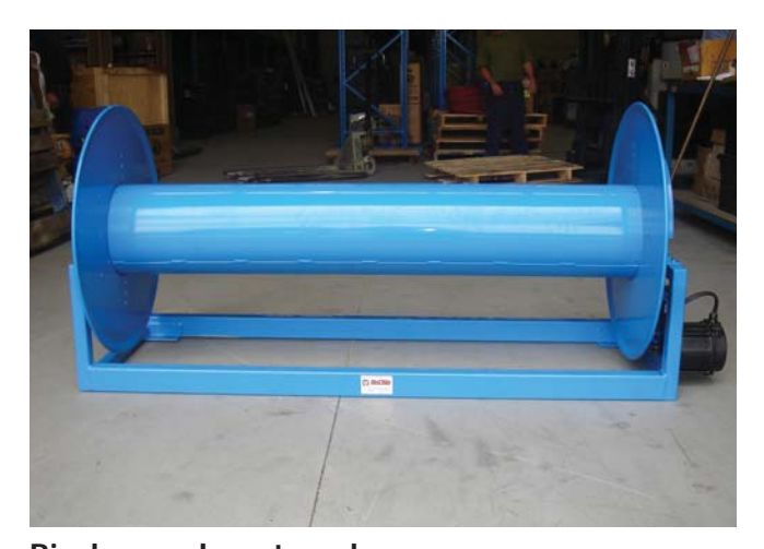
Bio hazard mat reel

CONTACT US WITH YOUR SPECIFIC REQUIREMENTS