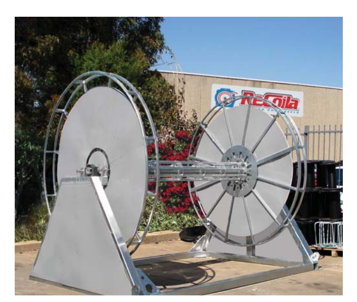
Large volume storage reels