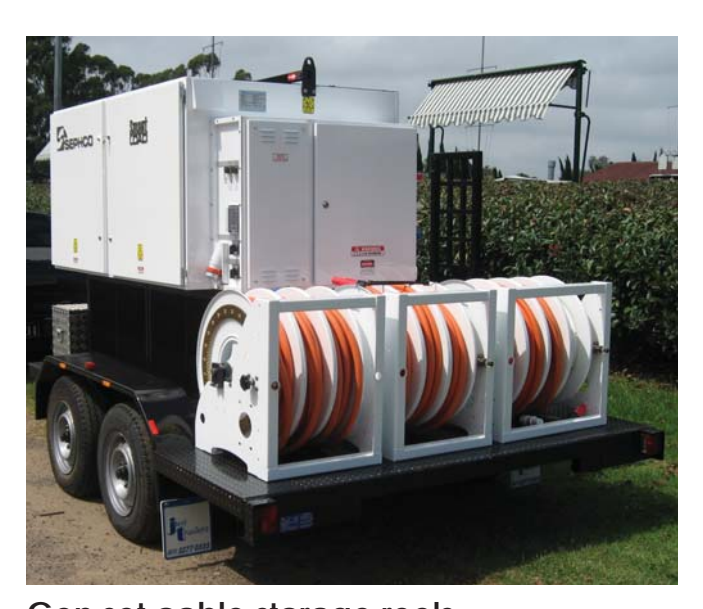
Gen set cable storage reels