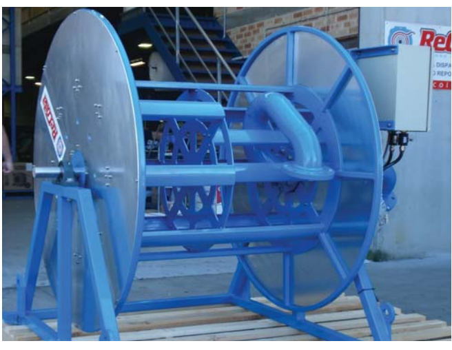
Pneumatic rewind 4" debunkering reel

CONTACT US WITH YOUR SPECIFIC REQUIREMENTS