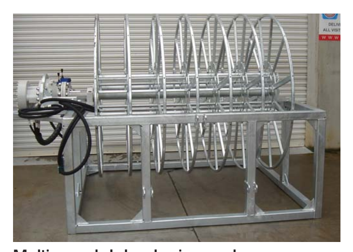
Multi-spool debunkering reel