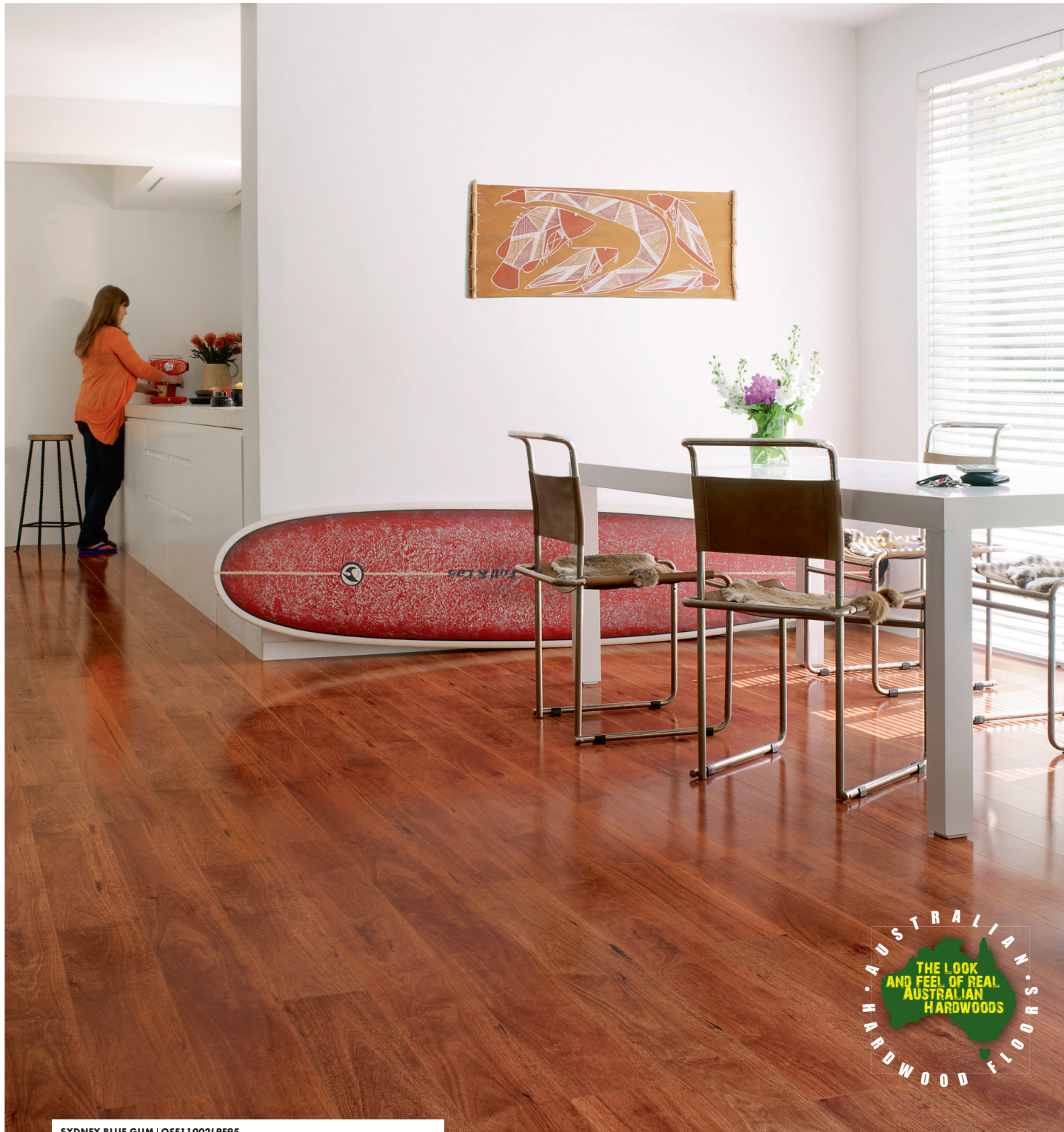
SYDNEY BLUE GUM | QSE11002LPE95

Warm and decorative, Sydney Blue Gum brings that expansive modern interior look to any residential or commercial application. It's fresh, original and peaceful to the eye. Its range of subtle hues are inspirational and inviting.