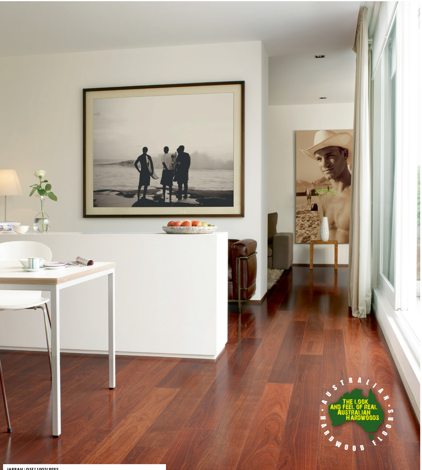
JARRAH | QSE11003LPE95