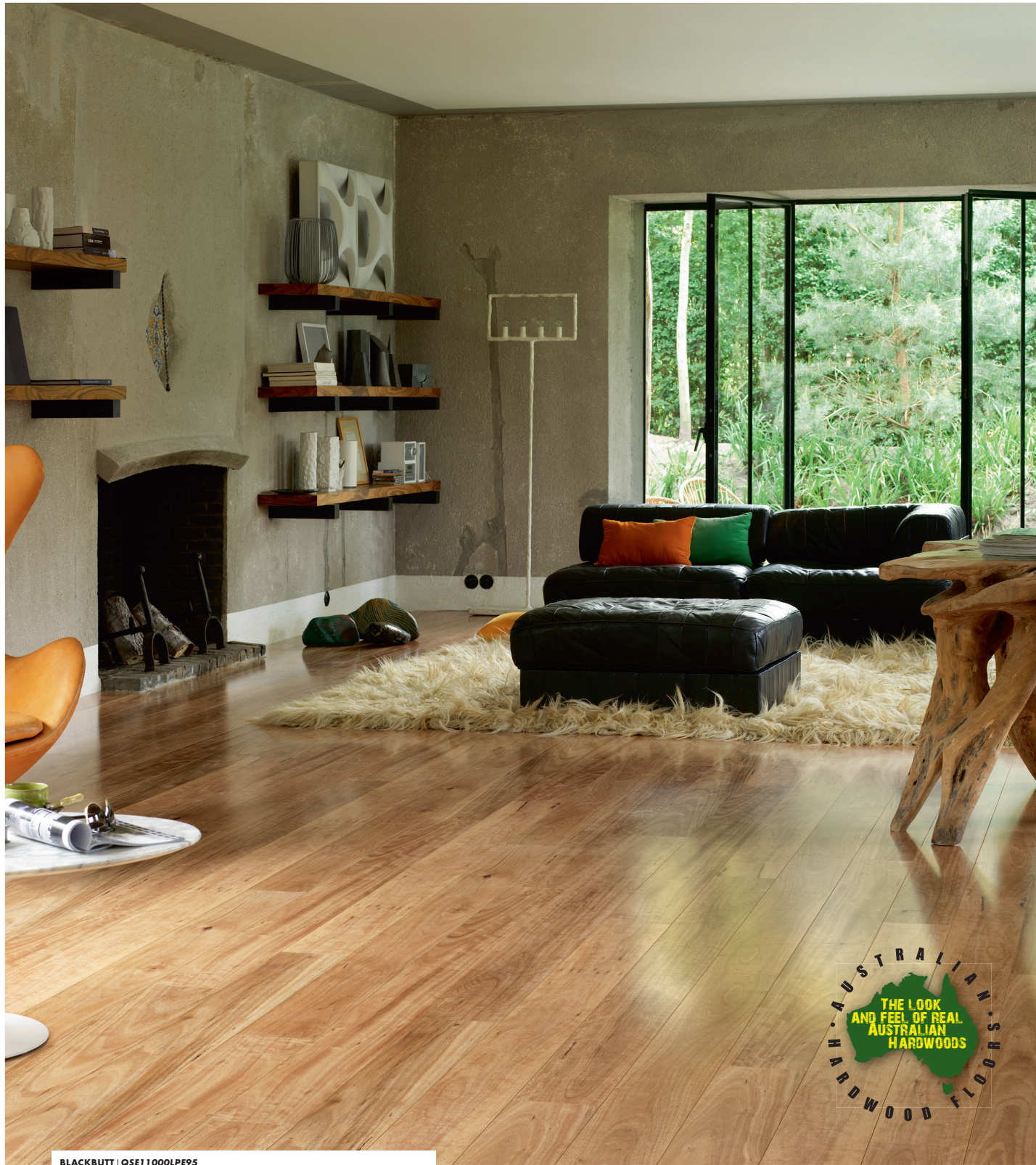
BLACKBUTT | QSE11000LP95