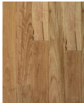
BLACKBUTT | QSE11000LPE95