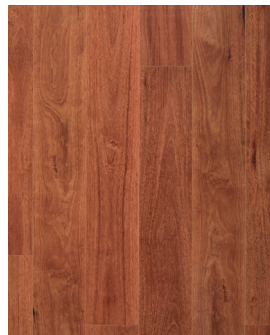
SYDNEY BLUE GUM | QSE11002LPE95