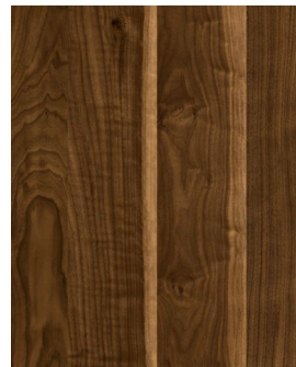
BRAZILIAN WALNUT | QSE11006LPE95

The printed designs give an idea of the actual color and nuances of the pattern but are not contractual. The patterns shown are only a sample and not a full overview of all the different nuances within the design.