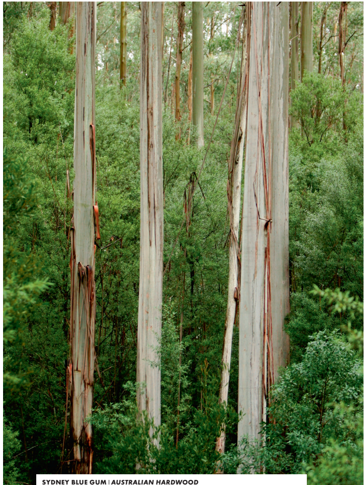
SYDNEY BLUE GUM | AUSTRALIAN HARDWOOD