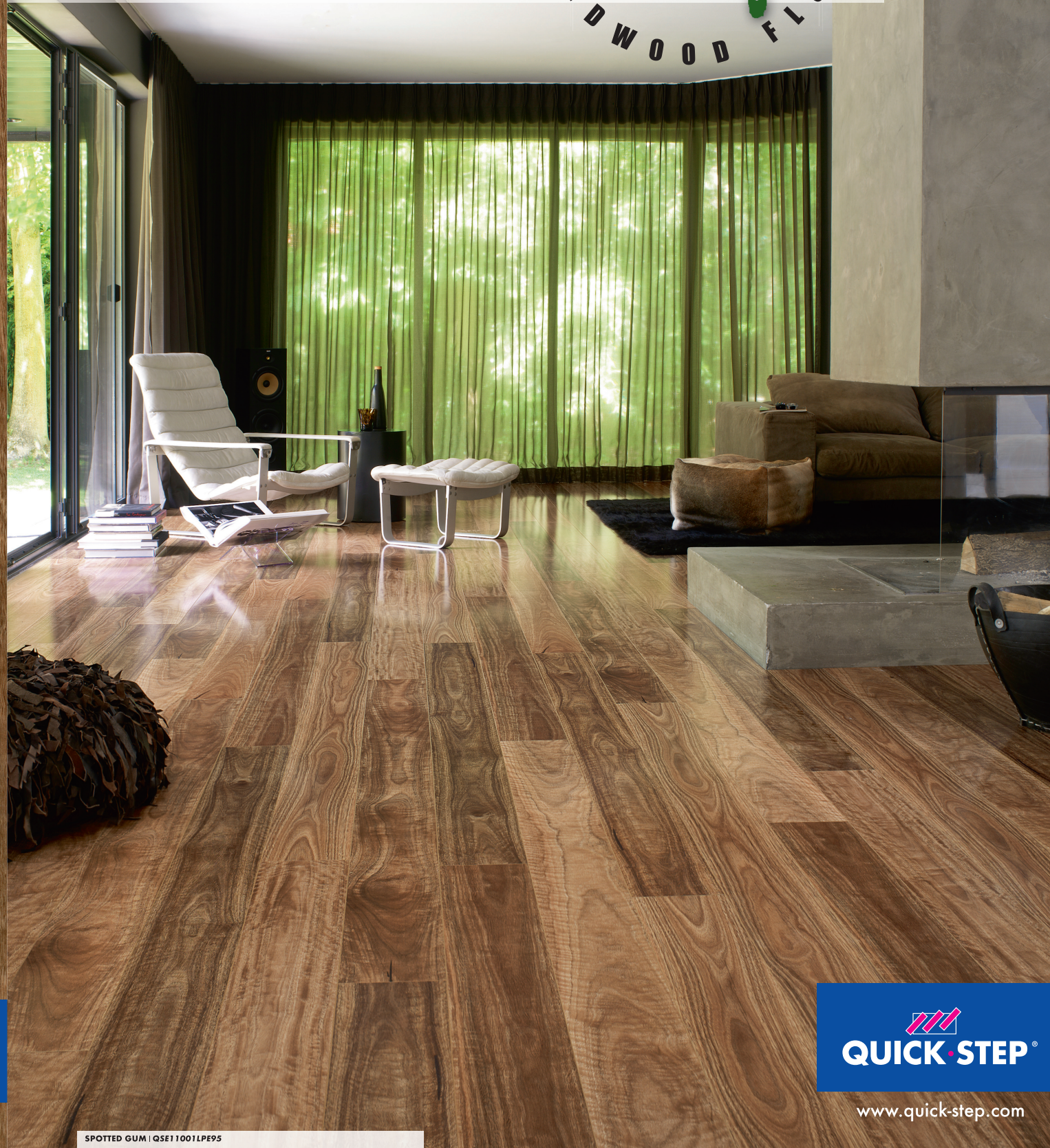
SPOTTED GUM | QSE11001LP95