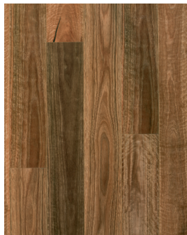
SPOTTED GUM | QSE11001LPE95

Inspired by the great outdoors with a rich blend of brown tones, Spotted Gum is as true to nature as the NSW hardwood that has fast become Australia's most popular wood flooring species. Let the light in, then relax and enjoy.