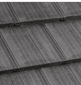
To view colour swatches for each state refer to www.monier.com.au

With its fine textured surface and flat profile, Georgian roof tiles recall the precise edges of colonial sawn timber shingles.