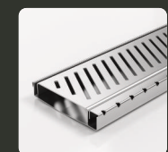
120SCSPASiMTL Punched Angle

Telephone 1300 653 403 | Web stormtech.com.au