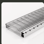
120SCSTRiMTL Standard Grate