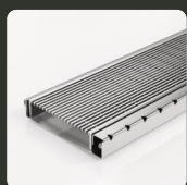
120SCSARiMTL Architectural Grate

Available in Stormtech's exclusive range of designer grates and tile inserts with natural stainless steel finish, or a luxurious electroplate or powder coat.