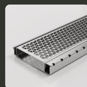
120SCSMNDiMTL Marc Newson Design