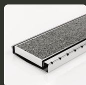
120SCSTiMTL Tile Insert