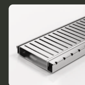
120SCSPPSiMTL Punched Perpendicular