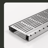
120SCSPSiMTL Punched Slot