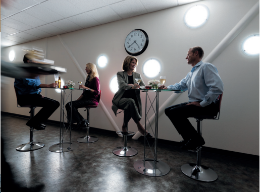
Solatube International Vista, CA