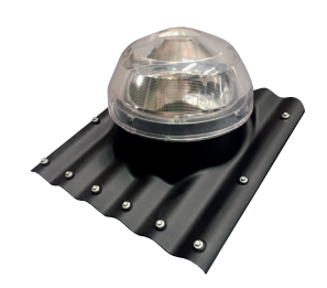
Corrugated Iron Flashing