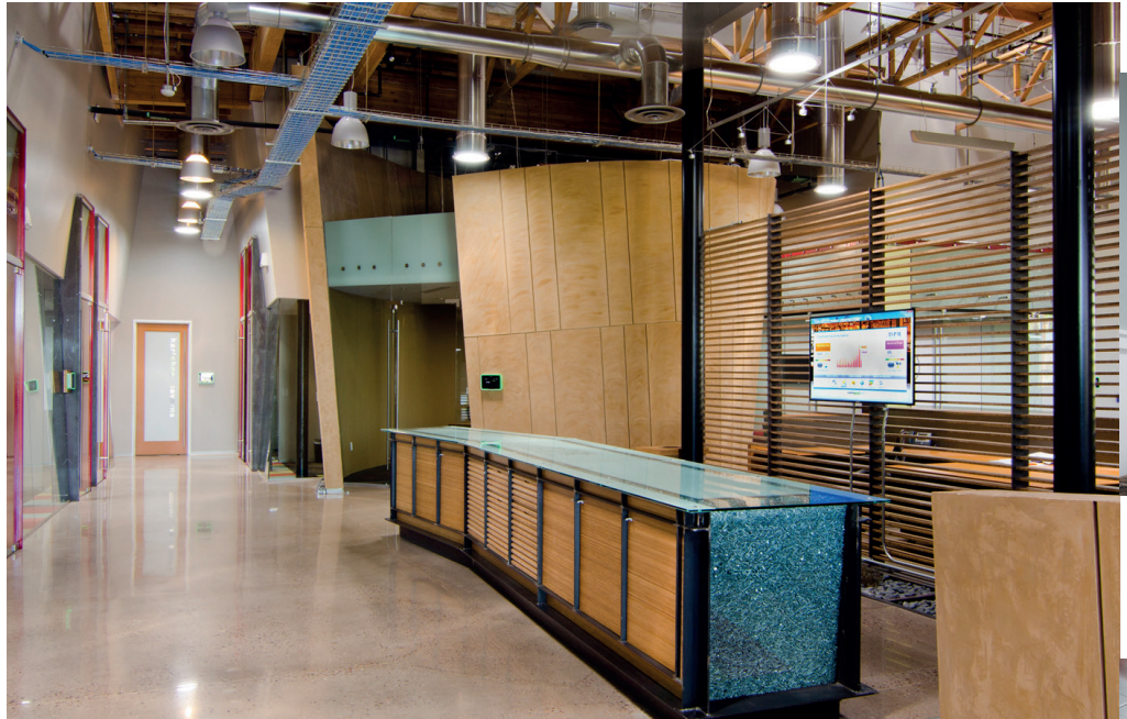
DPR Construction Phoenix, AZ