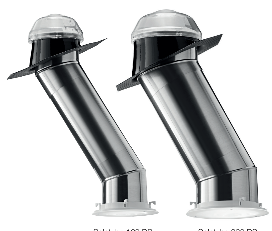
Solatube 160 DS

The Solatube 290 DS (350 mm/ 14 in. diameter) provides approximately twice as much light as the Solatube 160 DS and, in addition to lighting small offices and corridors, can be a great solution for large areas such as conference rooms.